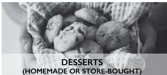
DESSERTS (HOMEMADE OR STORE-BOUGHT)