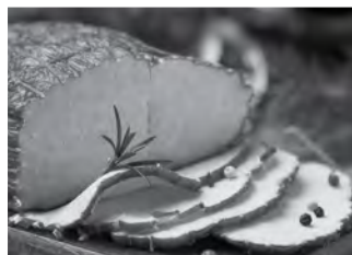
SPIRAL SLICED HAMS