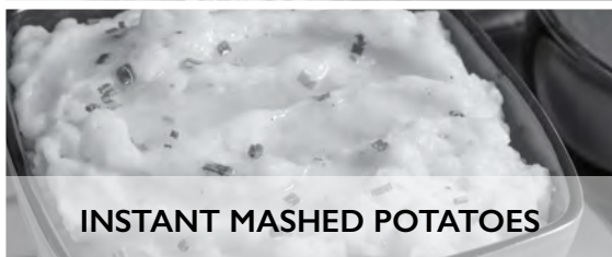
INSTANT MASHED POTATOES