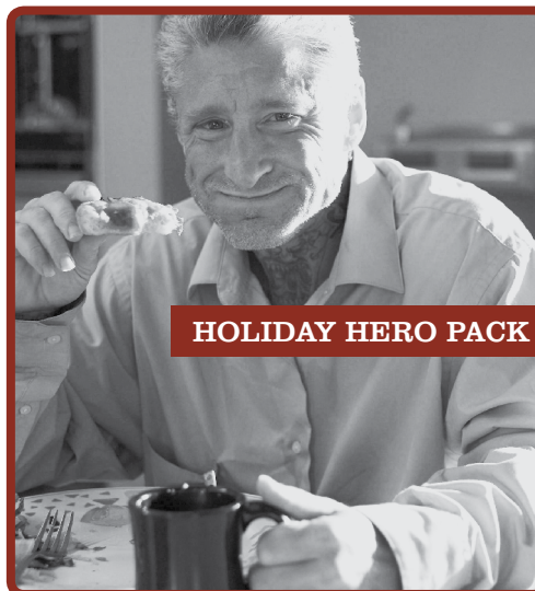
HOLIDAY HERO PACK